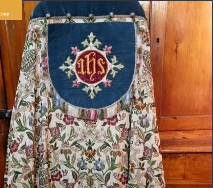
St Saviour's Cathedral Bishop Radford Vestments.