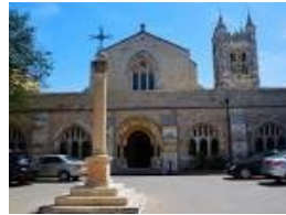
A Prayer for St. George's Cathedral, our sister church in Jerusalem

Almighty God whose hand has guided and sustained your Church through many generations, accept our prayers for this Cathedral church, bless all who serve within its walls and strengthen the hands of those who seek to ensure its future. Make it a constant witness to your glory and a place of peace and joy: for the sake of your Son our Saviour Jesus Christ. Amen